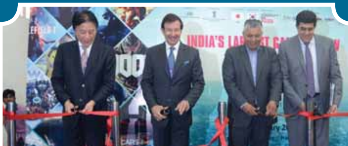
INDIA GAMING SHOW