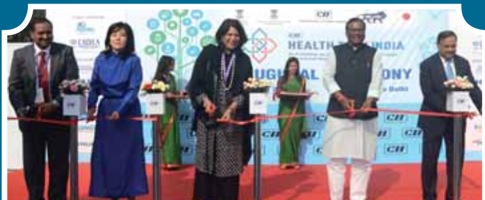
HEALTH TECH INDIA